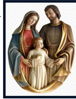
Holy Family Church

P.O. Box 502218, St. Tomas, U.S. Virgin Islands 00805 Telephone: (340) 775-1650; Fax (340) 775-1750 Website: www.holyfamilystt.com Email: holyfamilyusvi@gmail.com holyfamilyvi@msn.com