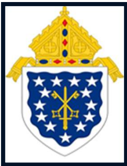
Saint Thomas Diocese