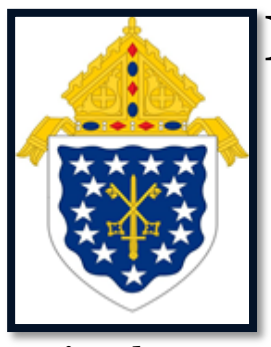
Saint Thomas Diocese