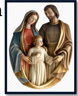
Holy Family Church

4B-B Estate Bovoni 394-213 Hidden Valley, St. Thomas, U.S. Virgin Islands 00802