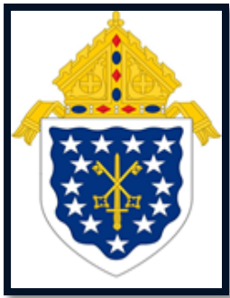
Saint Thomas Diocese