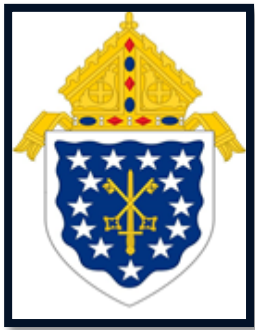
Saint Thomas Diocese