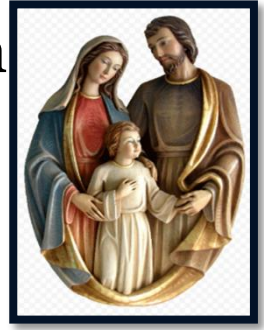
Holy Family Church