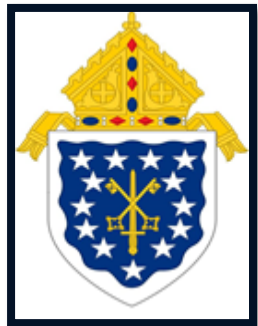
Saint Thomas Diocese