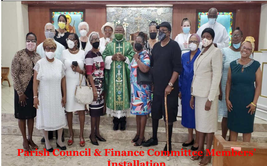
Parish Council & Finance Committee Members' Installation