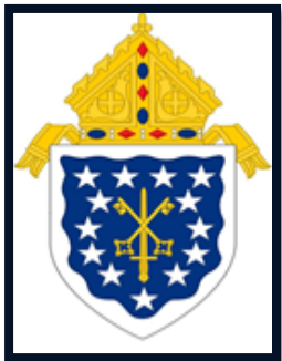
Saint Thomas Diocese