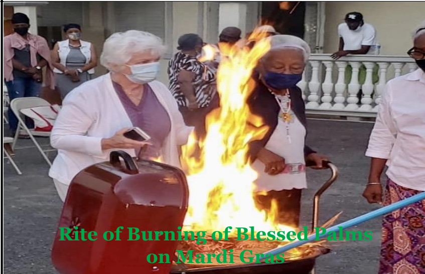
Kite of Burning of Blessed Palms on Mardi Gras