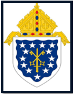
Saint Thomas Diocese