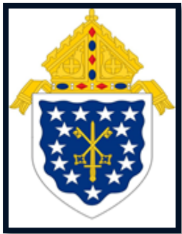
Saint Thomas Diocese