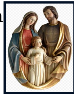
Holy Family Church