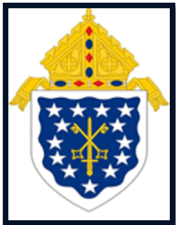
Saint Thomas Diocese