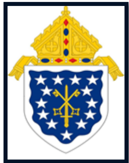
Saint Thomas Diocese