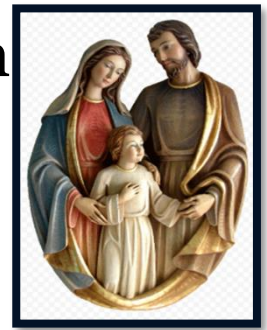
Holy Family Church