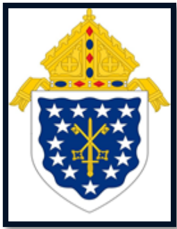
Saint Thomas Diocese