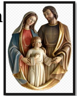
Holy Family Church