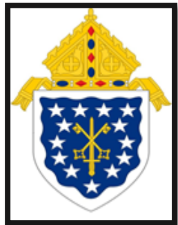
Saint Thomas Diocese