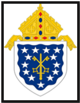
Saint Thomas Diocese