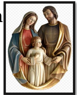
Holy Family Church

394-213 Hidden Valley, St. Thomas U.S. Virgin Islands 00802 Telephone: (340) 775-1650 Website: www.holyfamilystt.com Email: holyfamilyusvi@gmail.com