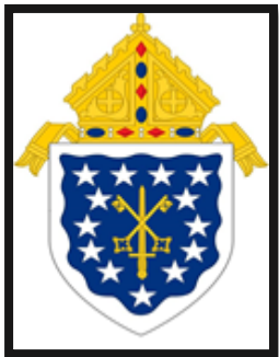
Saint Thomas Diocese