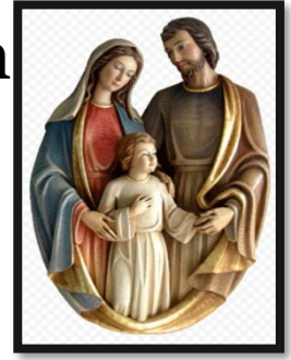
Holy Family Church

394-213 Hidden Valley, St. Thomas U.S. Virgin Islands 00802 Telephone: (340) 775-1650 Website: www.holyfamilystt.com Email: holyfamilyusvi@gmail.com