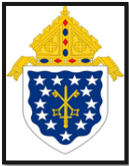
Saint Thomas Diocese