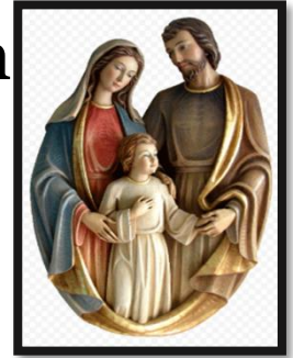
Holy Family Church

394-213 Hidden Valley, St. Thomas U.S. Virgin Islands 00802 Telephone: (340) 775-1650 Website: www.holyfamilystt.com Email: holyfamilyusvi@gmail.com