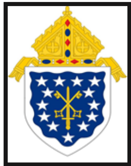
Saint Thomas Diocese