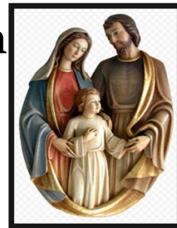
Holy Family Church

394-213 Hidden Valley, St. Thomas U.S. Virgin Islands 00802 Telephone: (340) 775-1650 Website: www.holyfamilystt.com Email: holyfamilyusvi@gmail.com