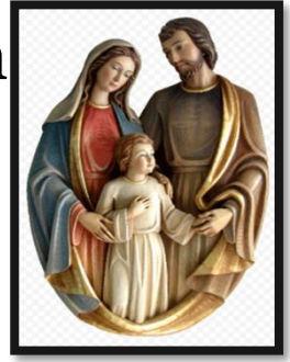
Holy Family Church

394-213 Hidden Valley, St. Thomas U.S. Virgin Islands 00802 Telephone: (340) 775-1650 Website: www.holyfamilystt.com Email: holyfamilyusvi@gmail.com