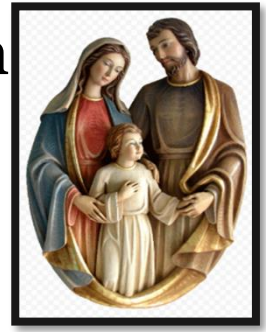
Holy Family Church

394-213 Hidden Valley, St. Thomas U.S. Virgin Islands 00802 Telephone: (340) 775-1650 Website: www.holyfamilystt.com Email: holyfamilyusvi@gmail.com