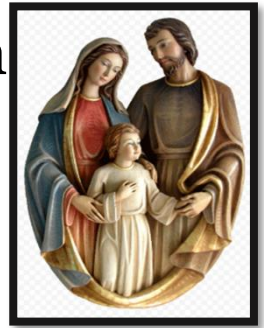
Holy Family Church

394-213 Hidden Valley, St. Thomas U.S. Virgin Islands 00802 Telephone: (340) 775-1650 Website: www.holyfamilystt.com Email: holyfamilyusvi@gmail.com