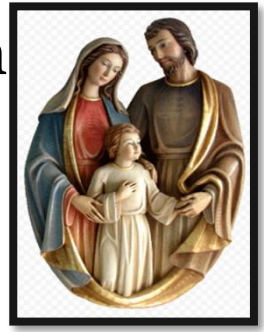
Holy Family Church

394-213 Hidden Valley, St. Thomas U.S. Virgin Islands 00802 Telephone: (340) 775-1650 Website: www.holyfamilystt.com Email: holyfamilyusvi@gmail.com