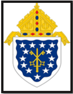
Saint Thomas Diocese