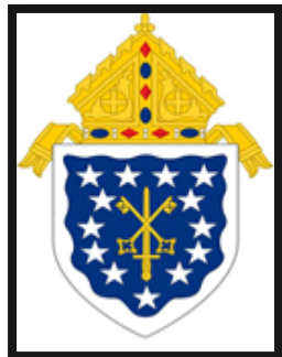
Saint Thomas Diocese