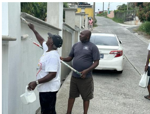
Appreciate a lady