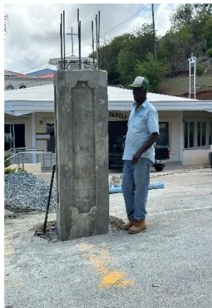
First Pillars. Chief Contractor