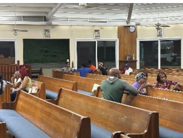
Life in the Spirit Seminar Charismatic Renewal