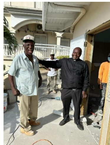
Satisfaction to our workers