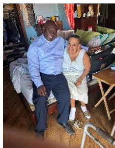
Visit of the sick