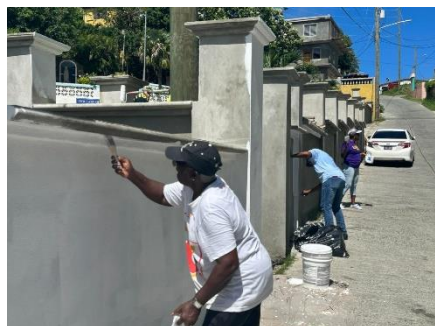
Painting of the wall