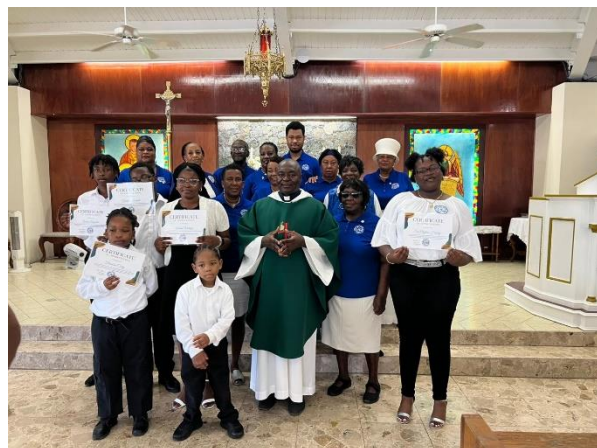
St. Vincent Ministry