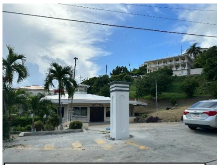
View of the entire parish