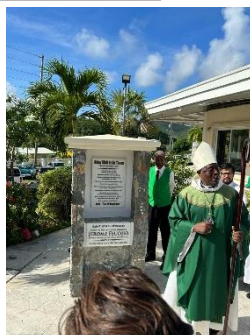
Blessing of monument