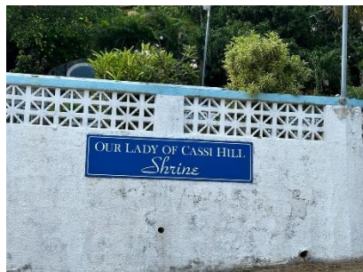
Cassil Hill Shrine