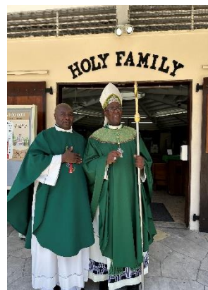
Bishop visit and blessing of the monument