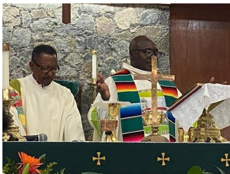
Dominican Independence Day Celebration