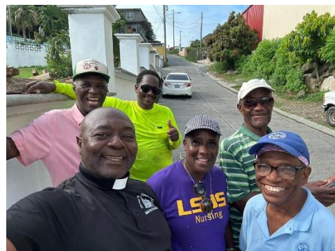
Joy to prove our talent