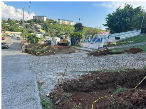
Groundbreaking of the security fence. July 2023