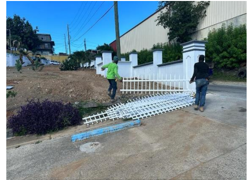
Installation of the grill fence

$18,000 of this amount is due to Balbo Construction Company.