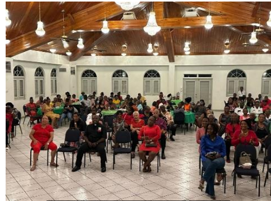
St. Joseph Workers Concert