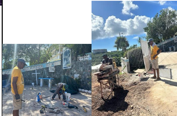
Replacement of tiles at the Shrine