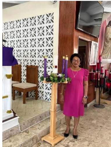
Advent wreath, 1 st Sunday of Advent