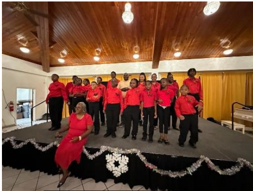
CCD Concert, Dec. 3, 2023