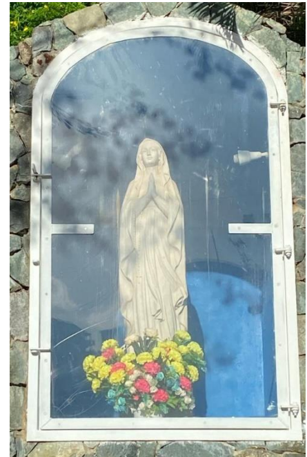
To Our Lady of the Rosary (after communion)

In summary, Holy Family Catholic Church has a balance due of at least $53,500 for the fence and restroom/gift shop projects.