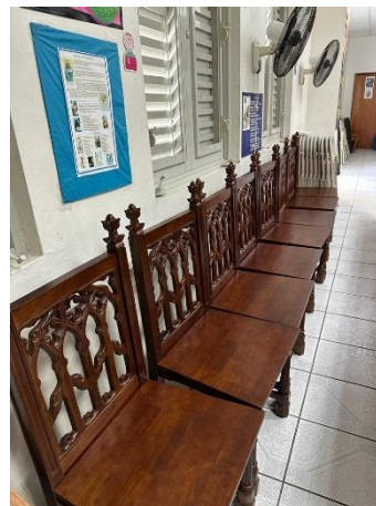
New altar's chairs