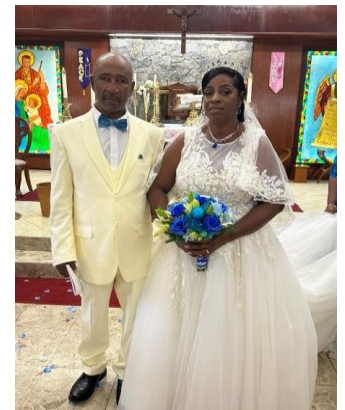
New couple married in our church Saturday, December 16, 2023