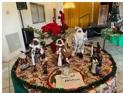
CCD's Deck the Hall Christmas Carol December 17, 2023