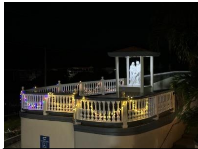
Holy Family statue decorated