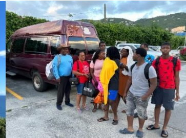
Our altar servers on the journey to Water Island after Christmas