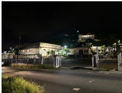
Holy Family Parish seen at night this Christmas Time