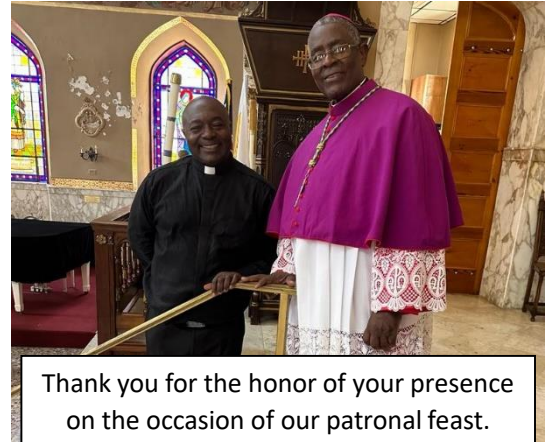
Thank you for the honor of your presence on the occasion of our patronal feast.