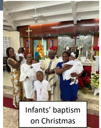
Infants' baptism on Christmas