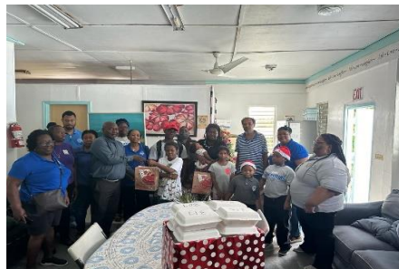
St. Vincent de Paul Society shares Christmas at Catholic Charities' Bethlehem House