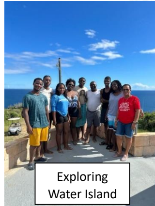
Exploring Water Island