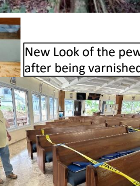
New Look of the pew after being varnished