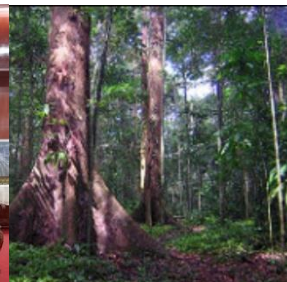
West African Okoume trees are gigantic and grow over 150 feet tall.