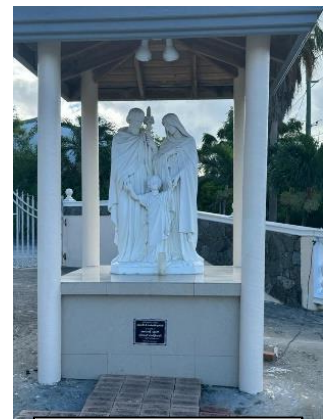
Holy Family statue