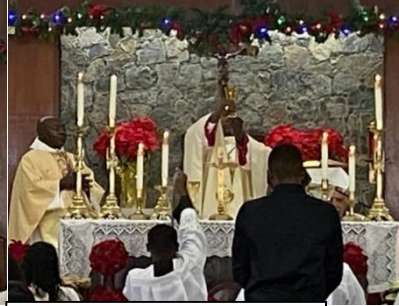
Patronal feast Holy Mass