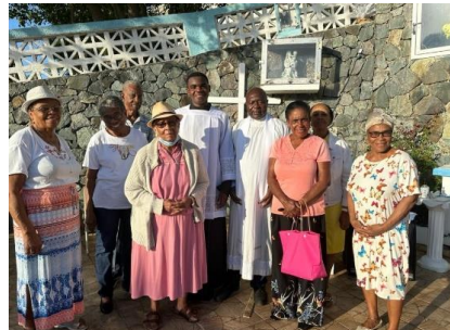
After Friday morning Mass at the Shrine—our last celebration with a seminarian.