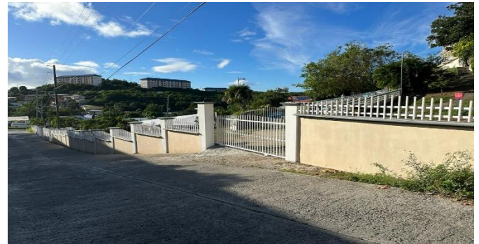
Completed security fence