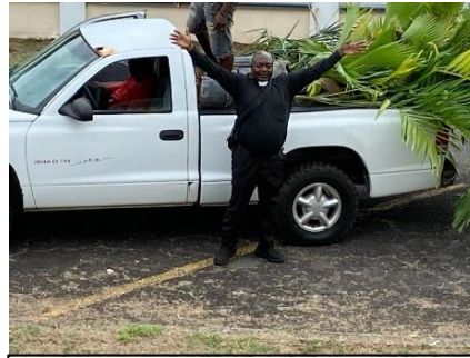
Arrival of the parking lot palms