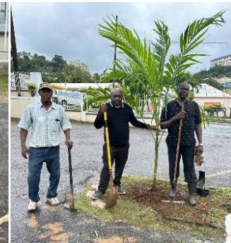
Planting of the palm trees in the parking lot