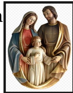
Holy Family Church

394-213 Hidden Valley, St. Thomas U.S. Virgin Islands 00802 Telephone: (340) 775-1650 Website: www.holyfamilystt.com Email: holyfamilyusvi@gmail.com