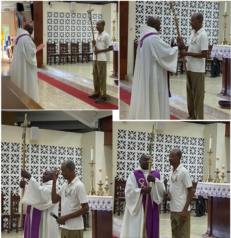
Station of the Cross