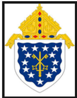
Diocese of Saint Thomas