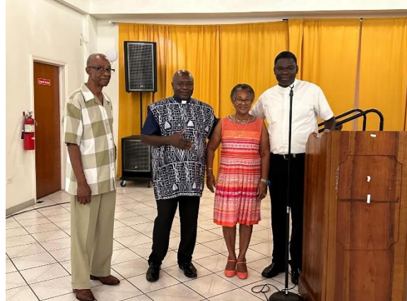
Closing remarks Mother's Day