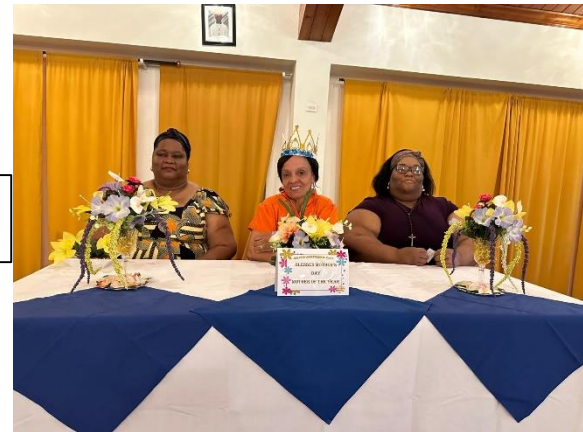
The Queens of the year