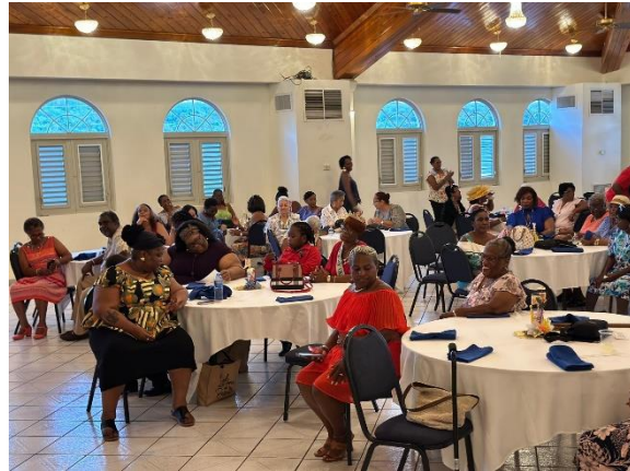
Mother's Day function