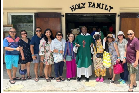
10:00 AM visitors