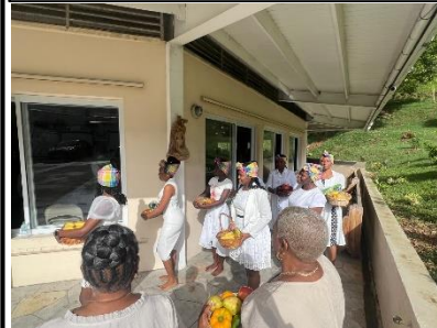
7:30 AM celebration