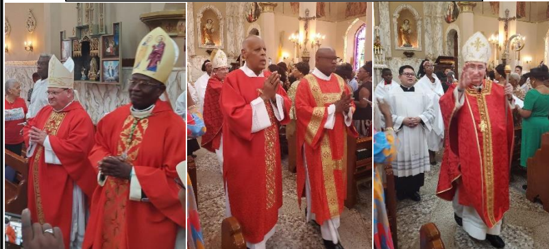
250 th Jubilee Solemn Mass