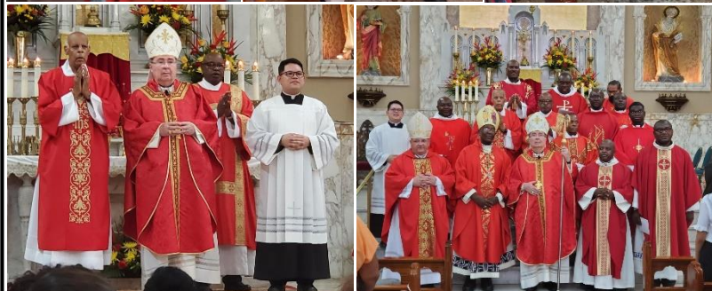
Christophe Cardinal Pierre Meet & Greet