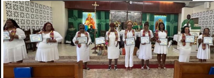
Bible class graduation