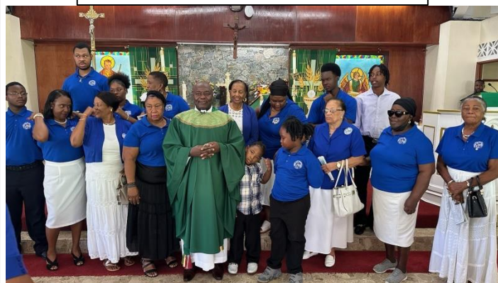
Holy Family at night