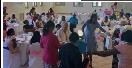
Kahoot tea party quiz