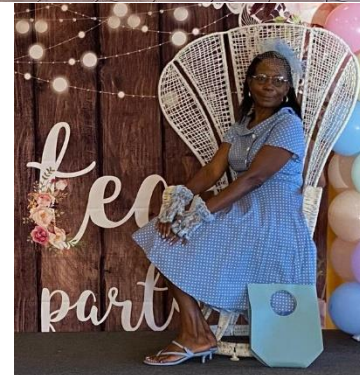
Miss Tea Cup