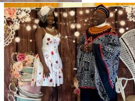
Best dressed male and female