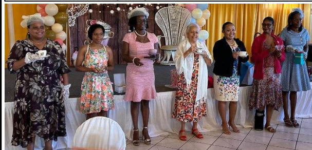
Tea cup swap