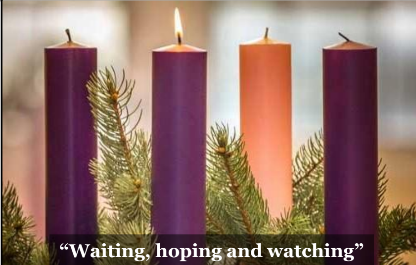
“Waiting, hoping and watching”