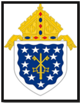
Diocese of Saint Thomas