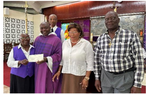
The Graduates of the Bible Class – 2 nd Class

St. Joseph Workers Contribution to the Air-Condition Project