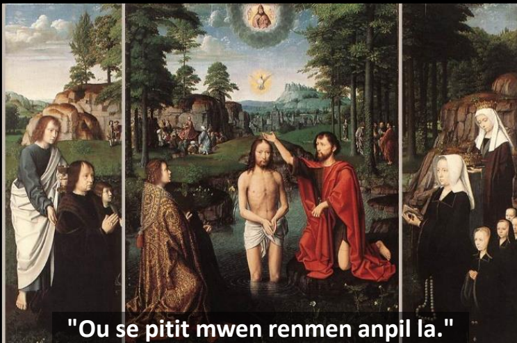
"Ou se pitit mwen renmen anpil la."