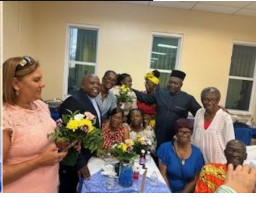
Distribution of framed pictures of Our Lady of Lourdes