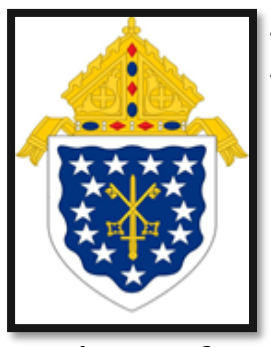
Diocese of Saint Thomas