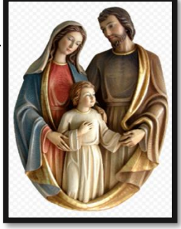
Holy Family Church