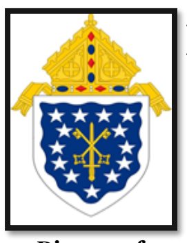
Diocese of Saint Thomas