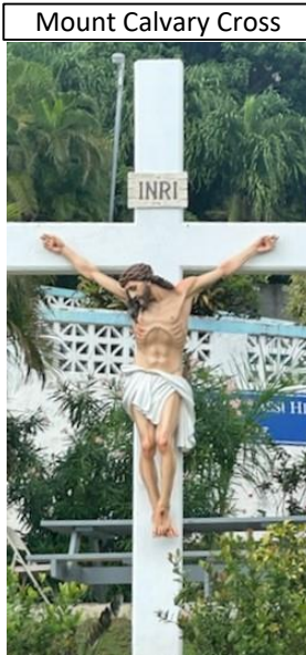
Mount Calvary Cross