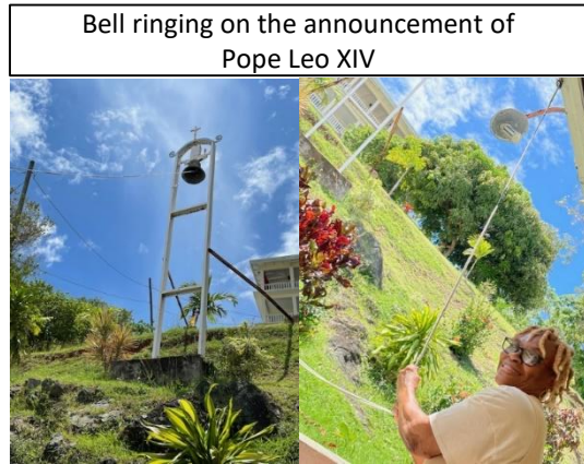
Bell ringing on the announcement of Pope Leo XIV