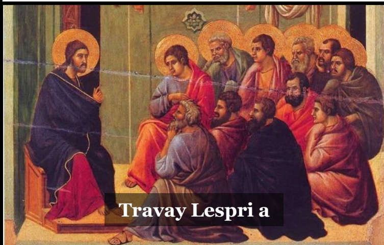
Travay Lespri a