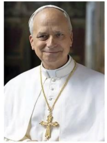
Leo P.P. XIV Pope Leo XIV