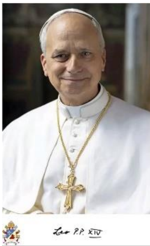
Pope Leo XIV