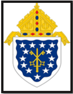
Diocese of Saint Thomas