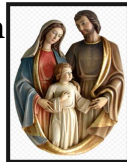
Holy Family Church

394-213 Anna's Retreat, St. Thomas U.S. Virgin Islands 00802 Telephone: (340) 775-1650 Website: www.holyfamilystt.com Email: holyfamilyusvi@gmail.com